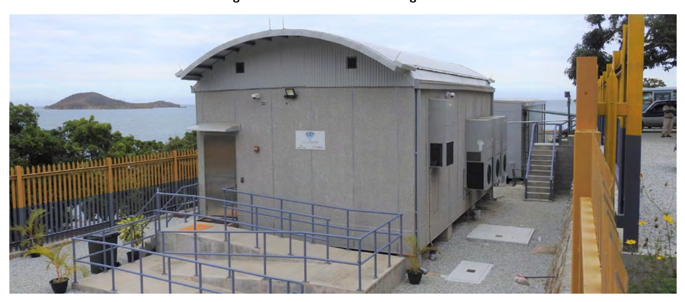
Figure 2. Coral Sea Cable Landing Station

The main contractor involved in CS2 was Australia-based Vocus Group with France-based Alcatel-Lucent Submarine engaged as a sub-contractor to build and lay cables. The cables were manufactured by Alcatel-Lucent Submarine in Calais, France, and shipped for installation by the company. The cable is owned and operated by the Coral Sea Cable Company Pty Limited, an Australian-registered company, with equal shareholding by the Commonwealth of Australia, PNG DataCo Ltd., and Solomon Islands Submarine Cable Company, a wholly government-backed company. The final splice to complete the cable was made on September 27, 2019. The cable went online in February 2020 and was officially launched by PNG's Prime Minister, Hon James Marape on June 5, 2020. While now online, the PNG network has not reached the wide usage expected by the government due to delays associated with regulatory and pricing issues between DataCo and NICTA and low uptake by local internet service providers (ISPs), which generally found prevailing satellite connections remained more affordable. As of March 2021, the installation of the cable does not seem to have had any impact on mobile prices, with DataCo's use of the CS2 funding to cross-subsidize the KSCN potentially having a negative impact on prices.