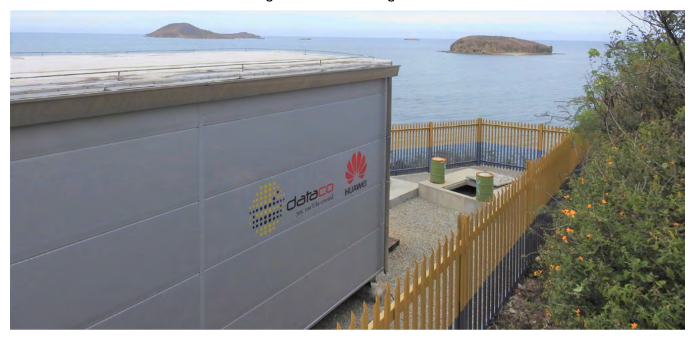
Figure 3. KSCN Landing Station