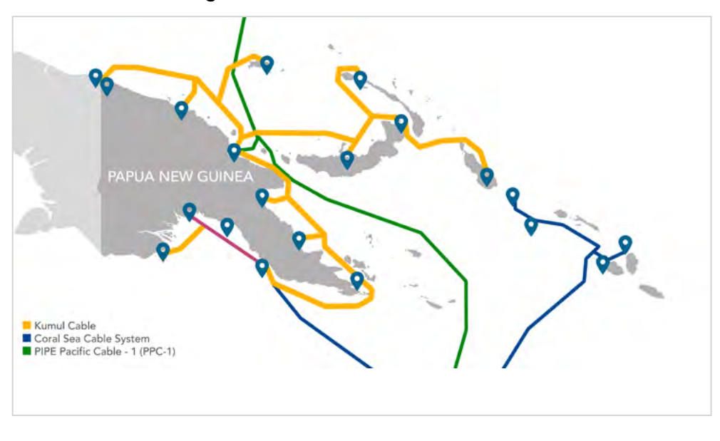
Figure 1. National Transmission Network